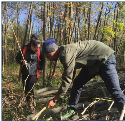
Allegheny students at Moxie Woods.